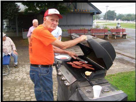
Yo mate...the dogs are ready