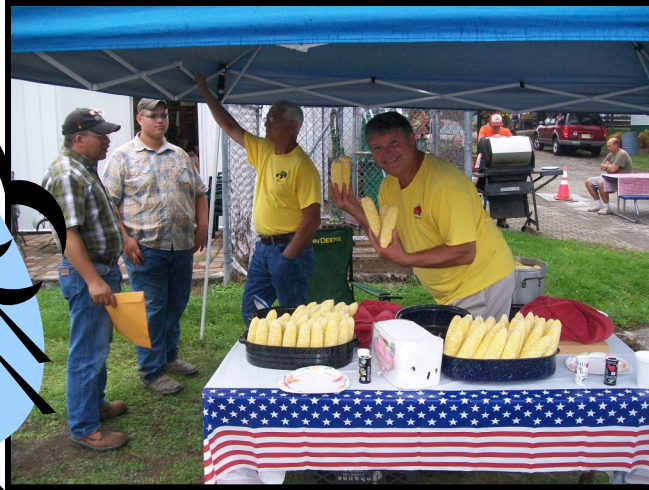
Fresh corn from LOCKBURNER FARM of Hampton NJ